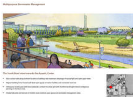
South Bowl - Photo Credit: UC Merced