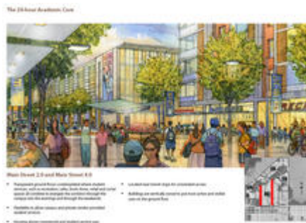
Main Street 2.0