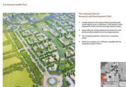
Gateway District