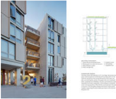
Wastewater recycling schematic

Water conservation was a top priority for this project, as it is both a scarce resource in Southern California and requires a significant amount of energy to transport from its distant source. The design response was two-fold, first focusing on conservation, and second on recycling. The conservation measures included water-efficient landscaping and a full suite of efficient plumbing fixtures, such as low-flow toilets.