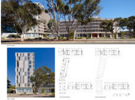
Plans and elevations