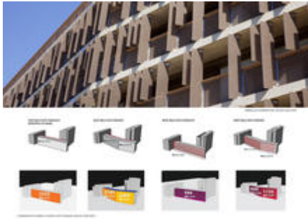
Comparison of energy savings with different shading and massing options

The building functions as a selective environmental filter, enhancing the best components of the regional climate to address heating, cooling, and ventilation needs, while rejecting the elements that jeopardize occupant comfort. The coastal location experiences highly regular afternoon breezes. To optimize the cooling effect, the building mass and window openings were shaped and sized to best capture the breezes based on landscape-scale CFD modeling. To ensure occupant comfort, an easily ventilated single-loaded corridor scheme was generated and a scale model was wind-tunnel tested, with the resulting pressure differentials on the envelope used to inform the interior layouts and ensure adequate interior ventilation.