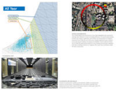
Psychrometric, wind and solar analysis informed the design