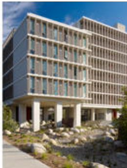
Bioremediation via green roof and bioswales

Rain events at UC San Diego are infrequent, but are often dramatic downpours that produce high volumes of runoff which, from this position atop the Pacific coastal bluffs, cause erosion to the fragile coastal scrub arroyos, a particularly threatened ecosystem. To counter this damage, the apartments use the natural slope of the site to provide limited natural infiltration, reducing the quantity of water and increasing the quality of the water released into the ocean. Water from the roof and a nearby parking lot is channeled and daylight through retention basins and bioswales.