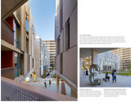
Outdoor circulation promotes social interaction - Photo Credit: Tim Griffith