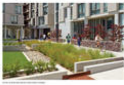
Stormwater management and habitat creation