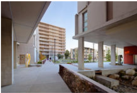
View entering plaza from the south