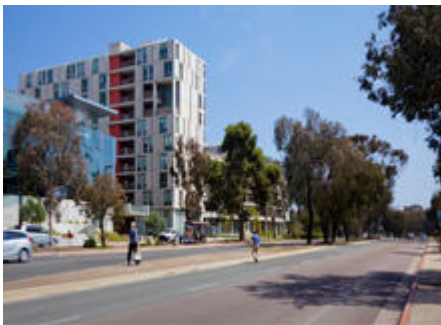
View looking south on Torrey Pines Road