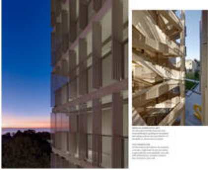
Materials and Construction

Materials used in the building are robust and long-lasting, with an 80-year life span. In addition, most surfaces are unfinished, eliminating the need for carpet, vinyl tile, or mastics.