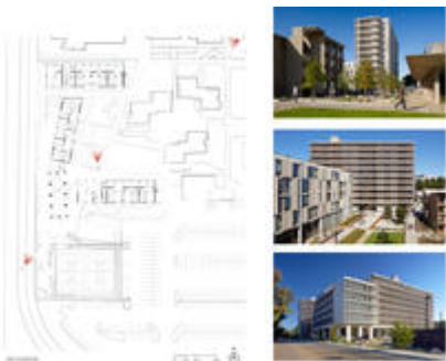
Site Plan and views - Photo Credit: Tim Griffith