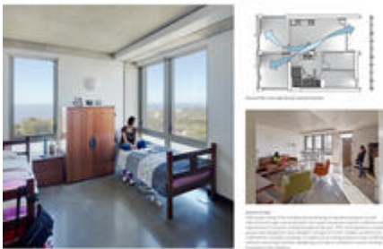
90% of all regularly occupied spaces receive daylight coverage of 25 foot-candles

The design maximizes the occupants' exposure to the best qualities of their environment. The location, on a bluff located above the Pacific Ocean, offers remarkable views as well as ready access to refreshing onshore breezes. The building is situated to provide expansive views of the ocean and mountains from all interior spaces, and from exterior walkways and the large roof terrace, which have become popular informal community gathering spaces.