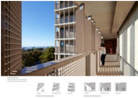
Single loaded corridors for passive cooling - Photo Credit: Tim Griffith