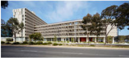
View of west facade from Torrey Pines Road

The Charles David Keeling Apartments are located on the southwestern edge of the UC San Diego campus overlooking the coastal cliffs of La Jolla. Named for the scientist whose research first alerted the world to the possibility of the human impact on global atmospheric carbon, the apartments employ a suite of tactics to address Southern California's pressing environmental challenges of stormwater management, water scarcity, and carbon emissions.