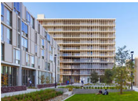
View of courtyard and north tower