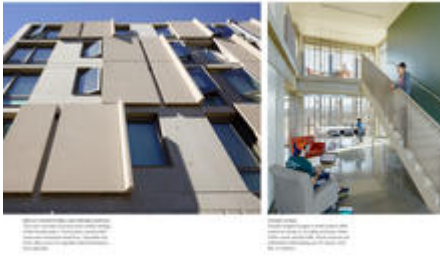
The cast-concrete structure from the outside, and a double-height lounge

The most significant reduction of energy on this project comes from the elimination of air conditioning based on scientific validation of the effectiveness of the proposed design. Both building mass and envelope are designed to manage solar gain and nighttime cooling and to ensure effective natural ventilation.