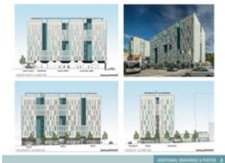
Additional Images - Second Image - Photo Credit: LMS Architects / Tim Griffith