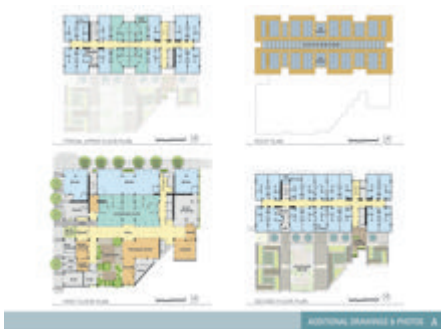
Additional Images - First Image - Photo Credit: LMS Architects