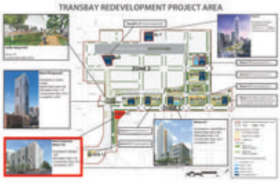
Measure 2 - First Image - Photo Credit: Office of Community Investment and Infrastructure