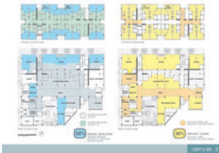
Measure 5 - Second Image - Photo Credit: LMS Architects

Comfortable and healthy living spaces are a key component of residences for formerly chronically homeless individuals who typically have physical disabilities.