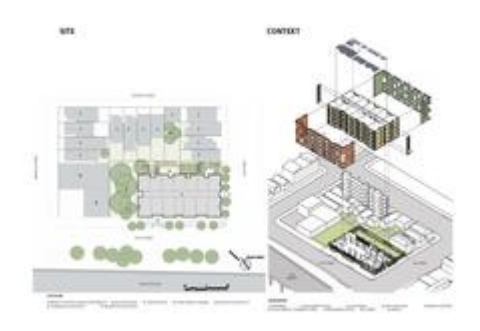
Site and Context Plans -Photo Credit: Architect