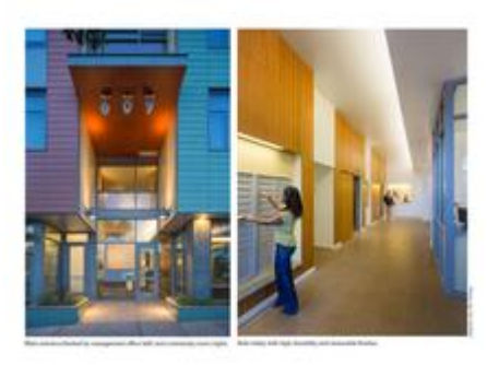
LEFT: Main entrance flanked by management office and community room; RIGHT: Main lobby with high-durability and renewable finishes