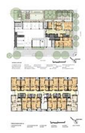
Floor Plans - Photo Credit: Architect