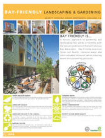
Bay Friendly educational signage located in the building lobby - Photo Credit: Architect