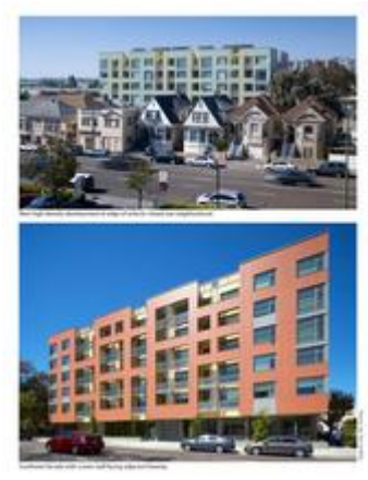
TOP: New high-density development at edge of eclectic mixed-use neighborhood; BOTTOM: Southwest facade with screen wall facing adjacent freeway