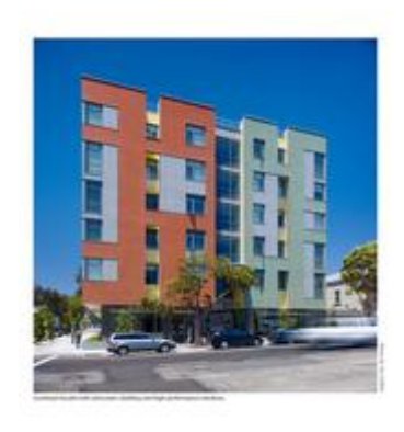
Southeast facade with rainscreen cladding and high-performance windows