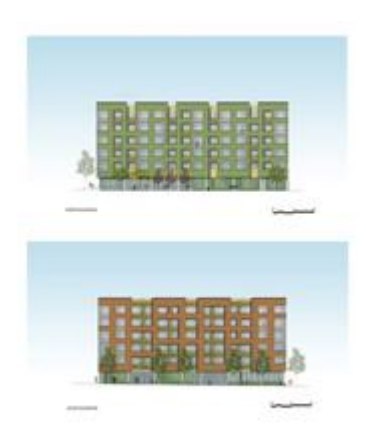
North and South Elevations - Photo Credit: Architect