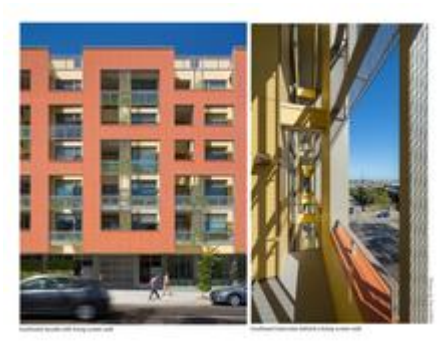
LEFT: Southwest facade with living screen wall; RIGHT: Southwest balconies behind a living screen wall