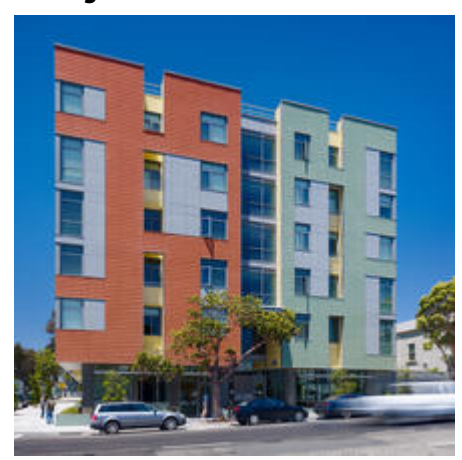
Merritt Crossing Senior Apartments

Located at the edge of Oakland's Chinatown, this new affordable senior housing transforms an abandoned site near a busy freeway into a community asset for disadvantaged or formerly homeless seniors while setting a high standard for sustainable and universal design.