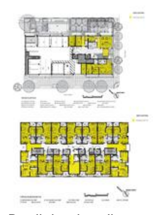
Daylight plan diagrams -Photo Credit: Architect